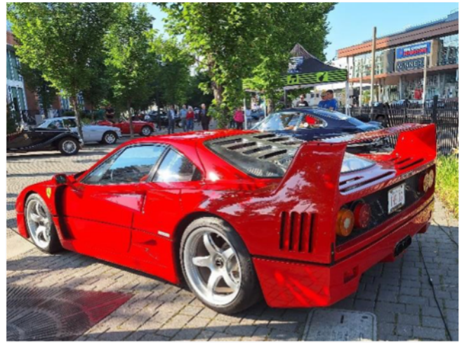
1991 Ferrari F 40