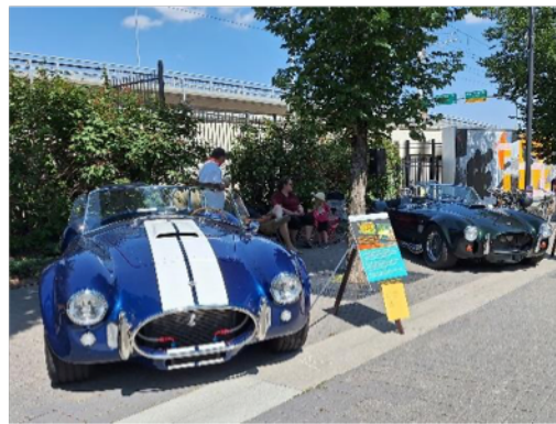
1965 Shelby Cobra