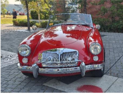
1961 MGA Mk 1