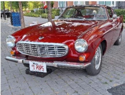
1969 Volvo P 1800 ES