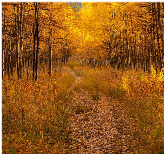
Bragg Creek