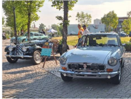
MG TF & MGB