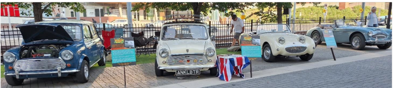
Austin Cars of the late 1950's and 1960's