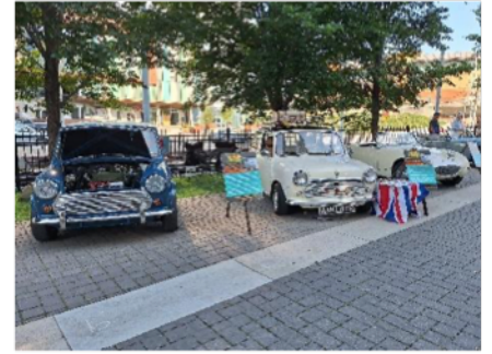
Mini Cooper S & Mini