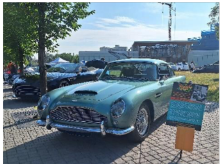
1964 Aston Martin DB5