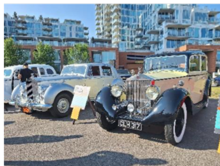
1935 Rolls Royce 20/25